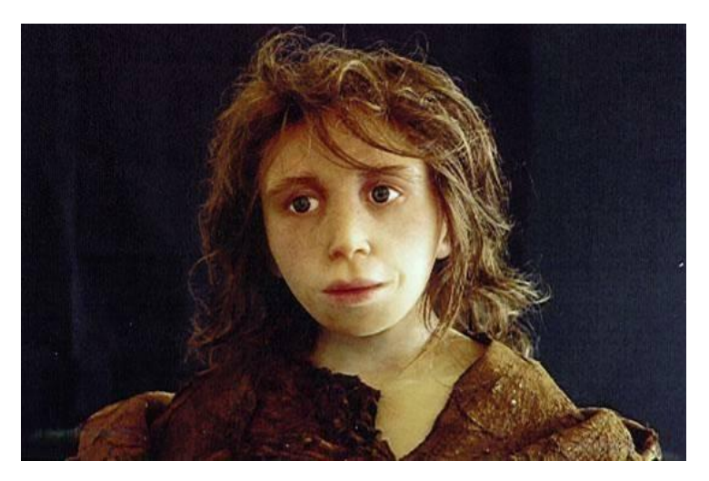
Gibraltar I: Reconstruction of a ca. four-year-old Neandertal PBS Neandertal (aka Homo neanderthalensis or Homo sapiens neandertalensis) Homo sapiens sapiens